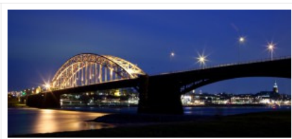
Nijmegen (by Maarten Takens )

The symposium continues the tradition of the previous three symposia of focusing on tone languages, aiming to present state-of-the-art research on the typological, phonetic, phonological, psycholinguistic, acquisitional and technological aspects of tonal contrasts, but will also welcome contributions on non-tone languages and art forms like songs and poetry.