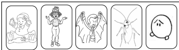
Figure 1: Giver's cards.

The CardTask is a speaking activity where a Giver and a Follower work in pairs. They sit at the same table but they cannot see each other because of the presence of a dividing panel. The Giver receives five cards; the Follower is given a deck of 25 cards. The Giver has to describe her five cards (fig. 1) and the Follower has two minutes to find each card in her deck. The Follower's task is rather difficult because the deck consists of very similar cards only differing from each other in small details (fig. 2).