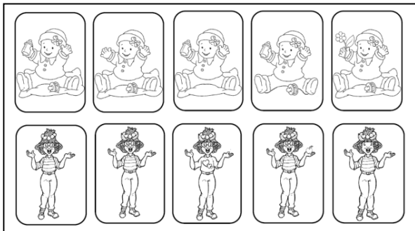
Figure 2: Examples of some cards in the Follower's deck.

In the room there is also an experimenter, whose function is basically to ensure that the task is performed as planned and to control some disturbing unexpected events which occurred during the game [19]. The following events were designed to elicit emotional linguistic reactions in the players and to arouse five different emotions (anger, anxiety, disgust, fear and surprise):