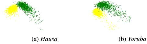
Figure 2: Acoustic diversity analysis of NaijaVoices and Common Voice datasets for Hausa and Yoruba languages. Using the unfinetuned MMS 1B model [2], we extract 1,280-dimensional feature vectors (from the last layer of the encoder), reduce them to two dimensions with PCA [28], and visualize them.

To assess the audio quality, we compute the signal-to-noise ratio (SNR) for all audio samples using the WADA-SNR algorithm [29]. As shown in Figure 3, approximately 65% of the samples achieve the highest possible SNR score based on the WADA-SNR algorithm, while the remaining samples fall within the clean audio threshold (SNR 20–100) as defined by [30]. These results indicate that the NaijaVoices dataset consists of relatively clean audio recordings.