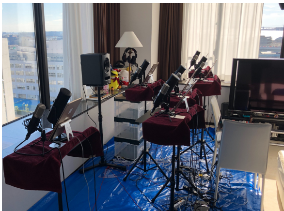
Figure 1: Recording setup. Under each environment, studio-quality speech is played through a monitor loudspeaker and re-recorded on three devices (iPad Air, Uber Mic, and MPM-1000) at six (A–E) positions.

27 conditions; DAPS: 12 conditions). Furthermore, instead of recording speech at a certain fixed position, DDS dataset covers variability in the microphone positions.