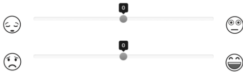
Figure 2: MoodSlider: Arousal (top): 'How "energised" do you feel right now and Pleasure (bottom): 'How pleased do your feel at the moment?'

language) along with self-reported mood in the SAAM project. It is noted that, in this pilot study, the privacy-based features were extracted for 16 recordings from 4 participants. For regression analysis, we averaged the privacy-based features (extracted for each voice segment) over an audio recording. The regression analysis was performed using linear and random forest regression methods in leave one (recording) out cross-validation setting using MATLAB. We used the Concordance correlation Coefficient (CCC) and Pearson Correlation Coefficient ( r ) for evaluation purposes. It is noted that the linear regression (0.3376) provides better r than random forest (0.2555). However, random forest provides the best CCC (0.2371) for joy prediction. For predicting the arousal score, random forest provides better results than linear regression, as shown in Table 1.