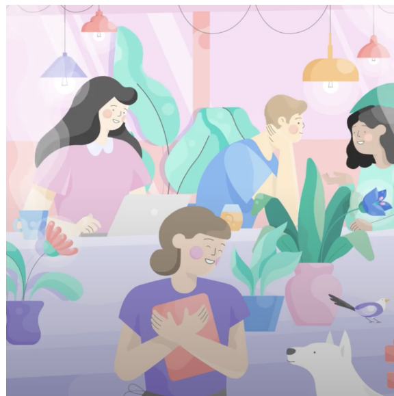
Figure 1: The Image Description Task; the image represents a café scene with several people. The image has many elements that are animated: the bird is moving, people are talking.

ory impairment, anhedonia and low mood. Participants also completed speech eliciting tasks, including an Image Description Task, and short point-and-click (or screen tapping) tasks measuring reaction times, accuracy and error rates, including an implementation of the classical n-Back task [19].