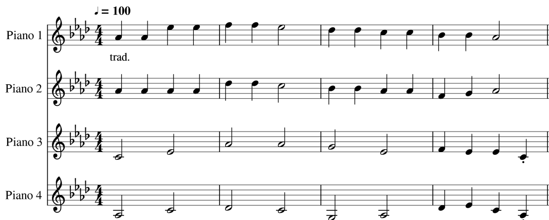
Figure 1: First four measures comprising the 10-second excerpt of “Twinkle Twinkle Little Star” with four piano parts.

samples after retaining a small number of principal components using PCA.