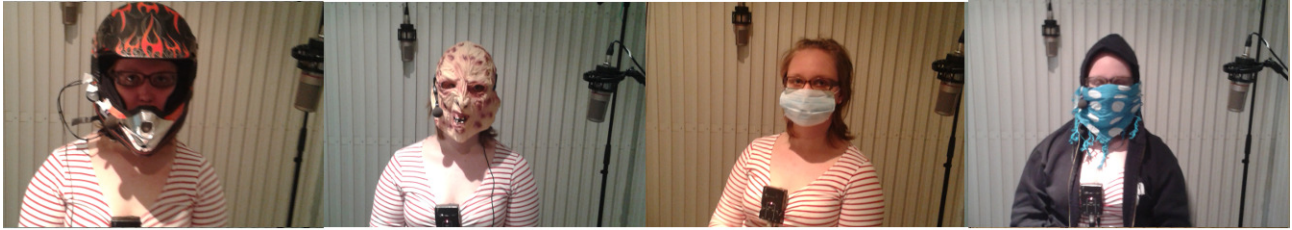
Figure 1: The speech material under face cover is collected with support from Finnish National Bureau of Investigation and University of Helsinki. A Finnish female volunteer wears 4 different face covers: motor cycle helmet, rubber mask, surgical mask and hood + scarf. The speech is recorded with 3 microphones. Both spontaneous and reading speech are considered.

manner. Apart from the acoustic absorption properties of the mask, by wearing a face mask, some of the speech articulation mechanism are also affected. Depending on the mask type and amount of its contact and pressure on face, the lips and jaw movements mostly become restricted. These muscle constrictions would in turn change the normal articulation of consonants like /p/ and /m/. The limited movement of the jaw caused, for example, by wearing a motorcycle helmet may result in a reduction of the range of the first formant of open vowels [5]. On the other hand, the talker might increase the vocal effort in order to compensate for the effect of face cover. Such effects are not extensively studied in the literature and the resulting effect on speaker recognition is consequently not clear.