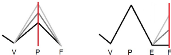
Figure 1: Schematic pitch contours of resynthesized stimuli. Left: Peak height variations, with pre-final V(alley), pitch P(eak), and F(inal) low. Right: Tail variations, with V and P as in the pitch set, an E(lbow) at the speaker's baseline, and F(inal) pitch height at varying heights at or above the speaker's baseline.

From each Peak height, a Tail set was also created. In order to create the Tail stimuli, an additional pitch point was set at a timepoint two-thirds of the way between the time of the pitch peak and the time of offset of phonation. This point was set to the speaker's baseline pitch. Then, the pitch at the offset of phonation was varied, being set at 0, 3, 5 or 8st above the speaker's baseline. The pitch variations are illustrated in Figure 1.