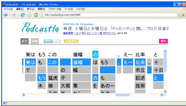
Figure 2: PodCastle screen snapshot of an interface for correcting speech recognition errors (competitive candidates are presented underneath the normal recognition results). Five errors in this excerpt were corrected by selecting from the candidates. The corrected Japanese sentence means “...well, actually the ratio of this price range and...”.

episodes at arbitrary intervals (daily, weekly, etc.). With RSS, updated episodes are automatically downloaded from the web and can be stored in any type of player. Podcasts are often referred to as audio blogs and their popularity has grown because anybody can publish and download audio data with ease. Just as full-text search services are essential for accessing text web pages, there is a growing need for full-text speech retrieval services such as PodCastle.