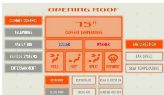
Figure 2: Screenshot of one of the GUI displays the example of Figure 2.

vehicle gauges, switch the system voice on and off, and change to a different voice. Each subsystem corresponds to a different layout of the GUI, with appropriate widgets designed for controlling the corresponding functionality, as in