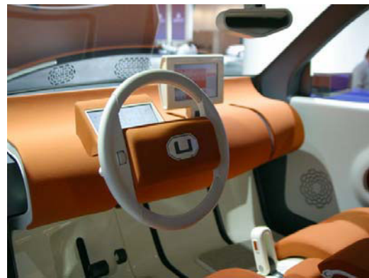
Figure 1: Picture showing the actual vehicle interior with the GUI display mounted on the dashboard.

GUI augments the speech interface by providing the user with additional information such as indications on the state of the dialog, suggestions on what to say, and feedback on the