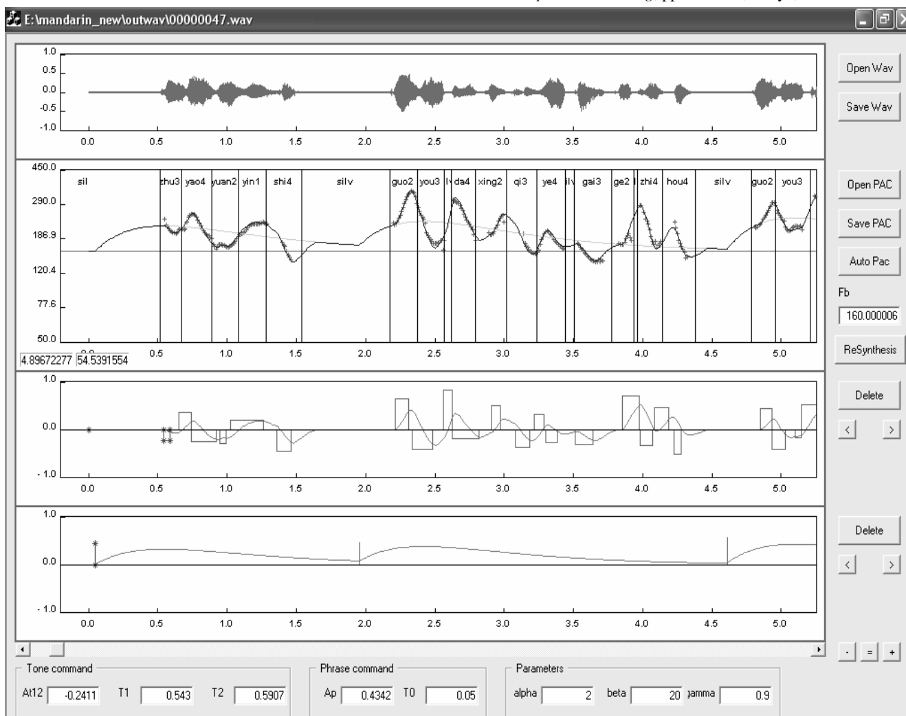
Figure 2. Resulting parameter configuration as displayed in the FujiParaEditor . From top to bottom: Speech waveform, F_0 contour, tone commands and resulting tone component, and phrase commands and resulting phrase component. The FujiParaEditor features real-time resynthesis based on Fujisaki model contour and integrated automatic extraction ('Auto Pac').