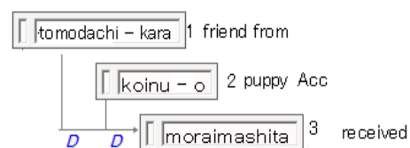
(a) I got a puppy from my friend.

I looked at dependency structure of Bunsetsu-phrases. Japanese is a head final language: A head Bunsetsu appears after all its dependent Bunsetsu-phrases. Figure 1 shows examples of Japanese sentences and their dependency structure. Sentence (b) has more complex structure than sentence (a). Each box represents a Bunsetsu. The number on the right of each box indicates id for the Bunsetsu in the sentence. Dependency relation is indicated by an edge from a dependent Bunsetsu to its head. The figure indicates that the last Bunsetsu, "moraimashita" has more dependent Bunsetsu in Sentence (b) than in sentence (a).